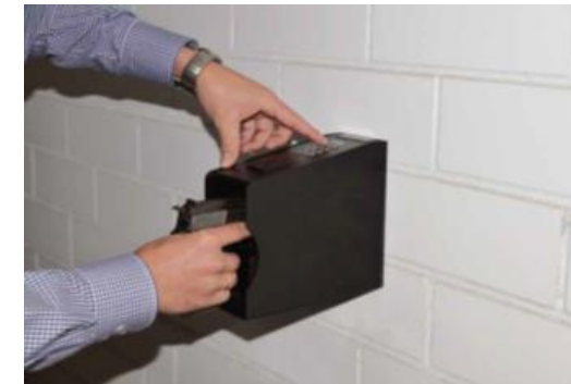
Wall mounting with PIN-Code and Fingerprint